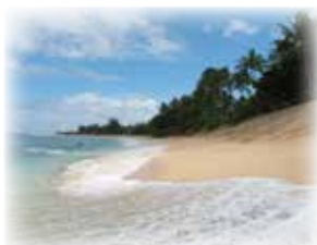
North Shore Beaches