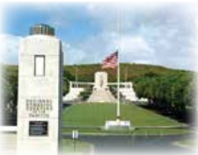
Punchbowl National Cemetery