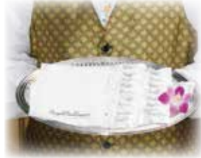
Mint and Hand Towelette Service