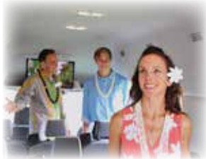
NEW Stand-up Style Van