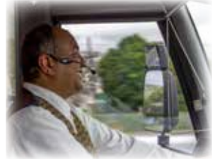
In-Depth Driver Narration