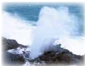
Halona Blow Hole