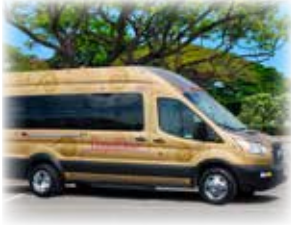
Pickup at your hotel in Waikiki

Unparalleled comfort aboard our Private Deluxe Tour Van with *Door-to-Door Service , original video , mint & hand towelette service and our exceptional Royal Star® driver guide.