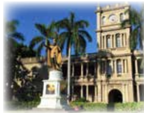
King Kamehameha Statue