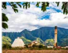
Waialua Coffee / Soap Factory