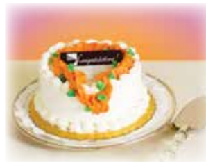
Lei Cake $40.00 (6" round)