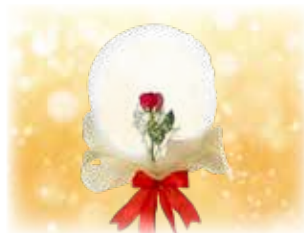
Rose in a Balloon $10.00