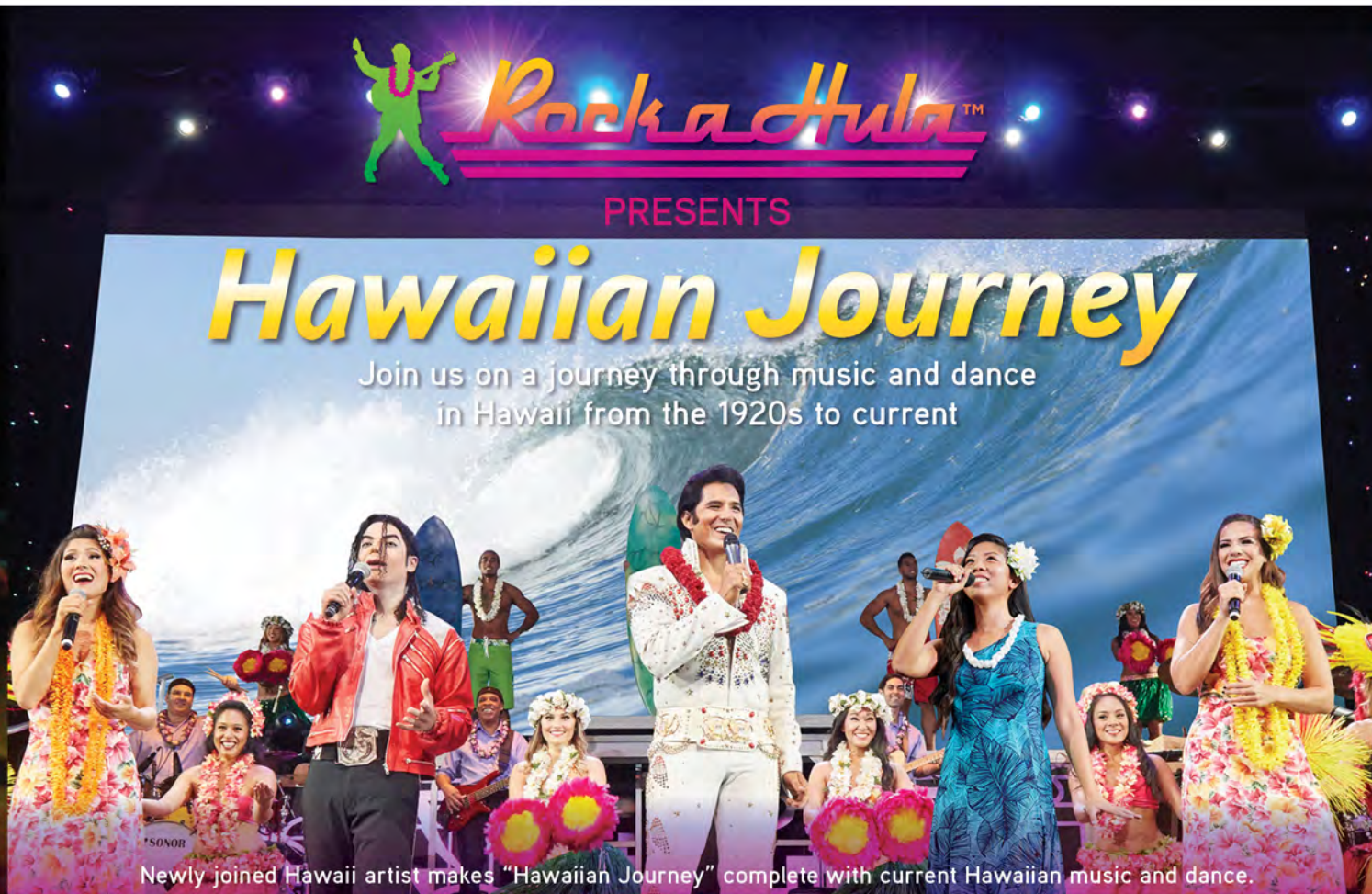
Newly joined Hawaii artist makes "Hawaiian Journey" complete with current Hawaiian music and dance.