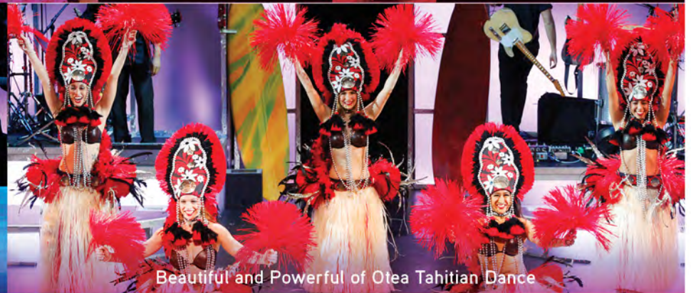
Beautiful and Powerful of Otea Tahitian Dance