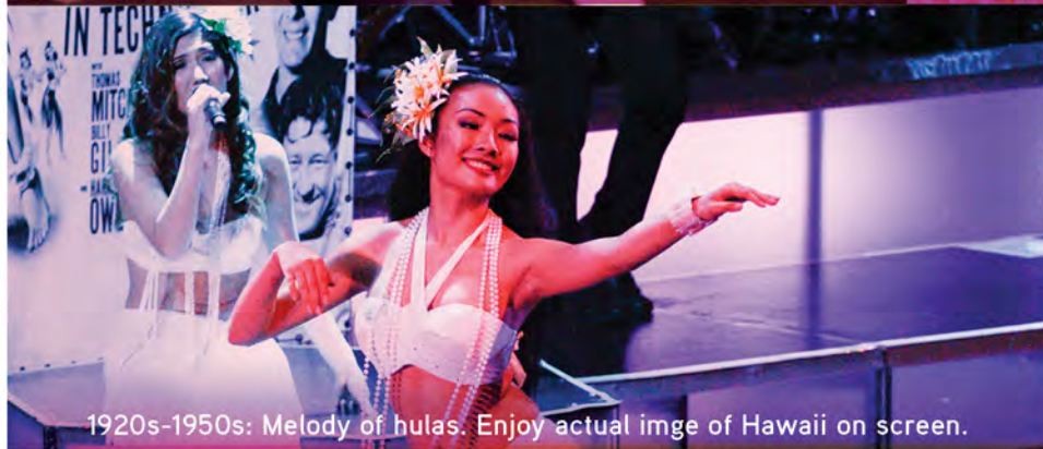
1920s-1950s: Melody of hulas. Enjoy actual image of Hawaii on screen.