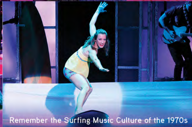
Remember the Surfing Music Culture of the 1970s