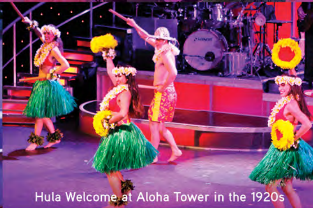
Hula Welcome at Aloha Tower in the 1920s