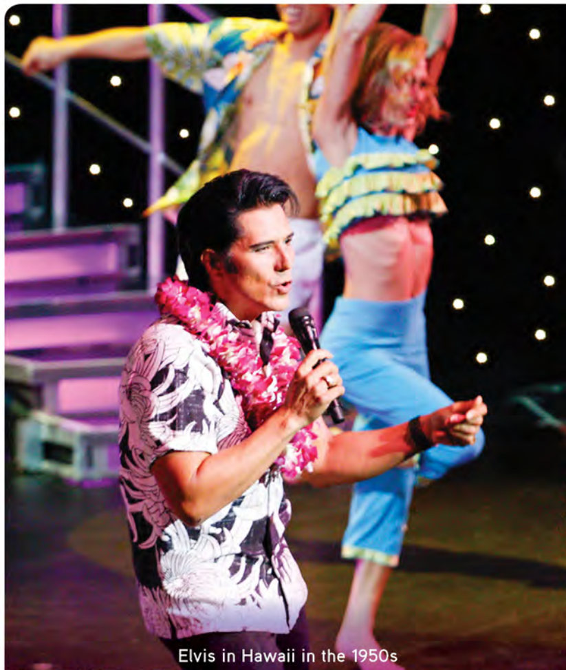
Elvis in Hawaii in the 1950s

Join us on a journey through music and dance in Hawaii from the 1920s to current