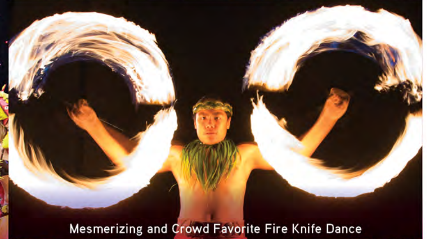
Mesmerizing and Crowd Favorite Fire Knife Dance